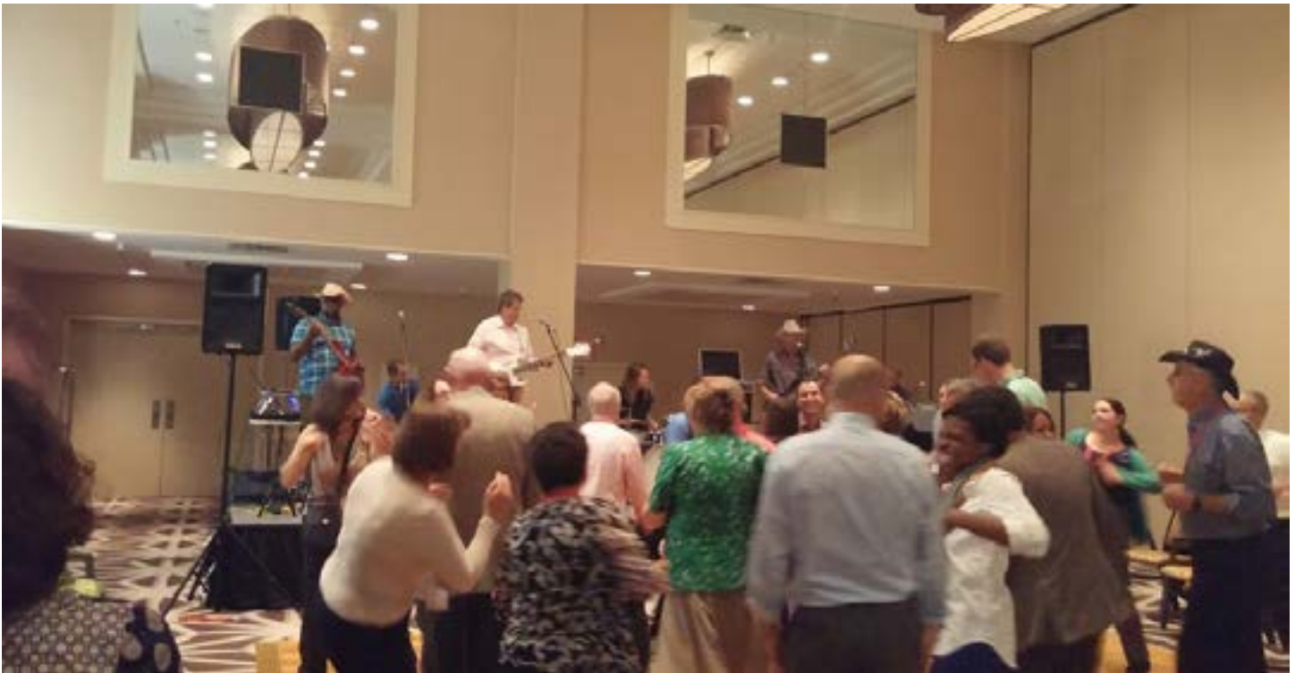
Dancing the night away at the President's party!