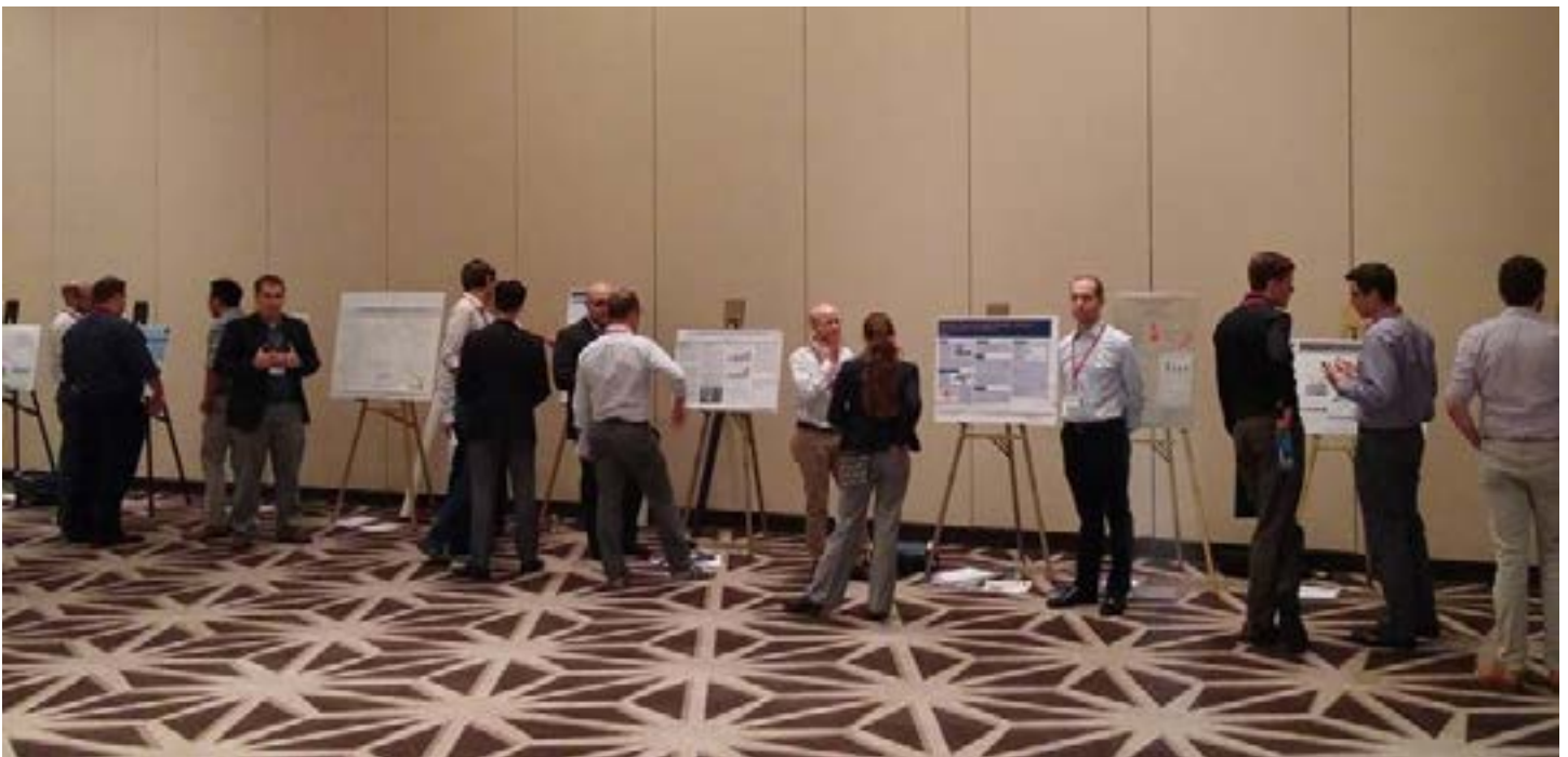
Graduate students selling their wares.